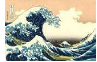
D&T: Building Structures